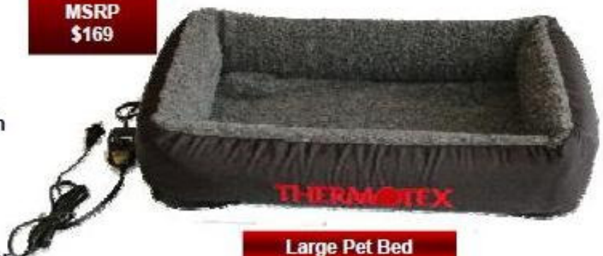
Large Pet Bed