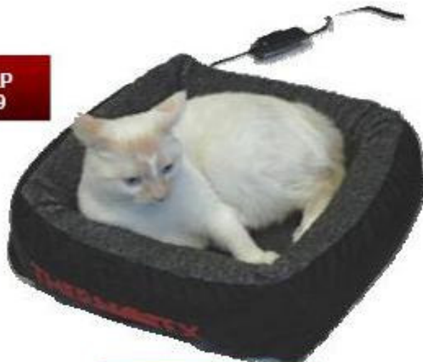
Small Pet Bed