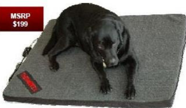
Large Pet Pad

Velcro opening for easy heat panel and foam removal prior to washing the bed cover